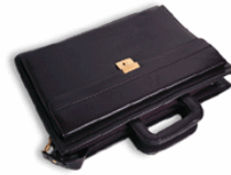
Proposed TCC HIT curriculum revisions have quicker coder employment as goal

Since the revisions involve moving certain courses typically taught during the second year (such as statistics) to the first year of study, the curriculum change will still allow the continuation of coursework through the following year to obtain an Associate's degree in